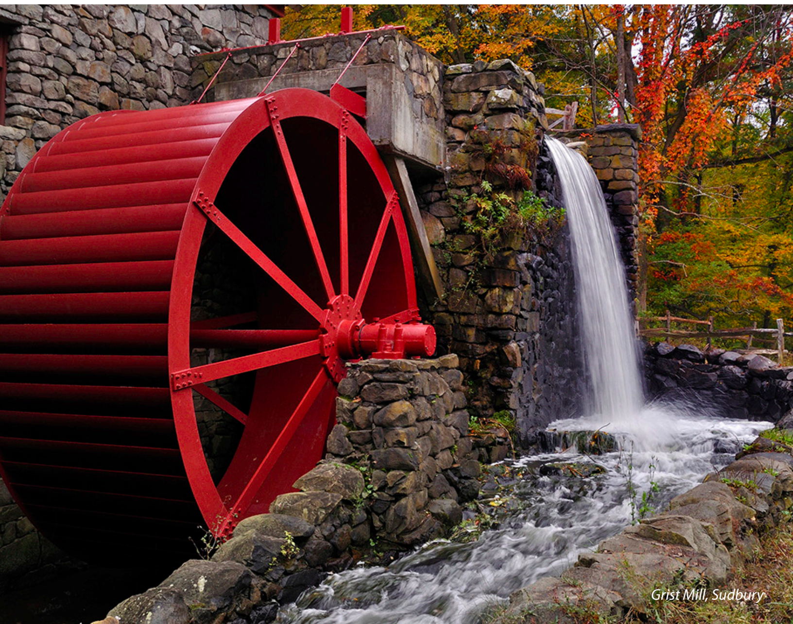
Grist Mill, Sudbury