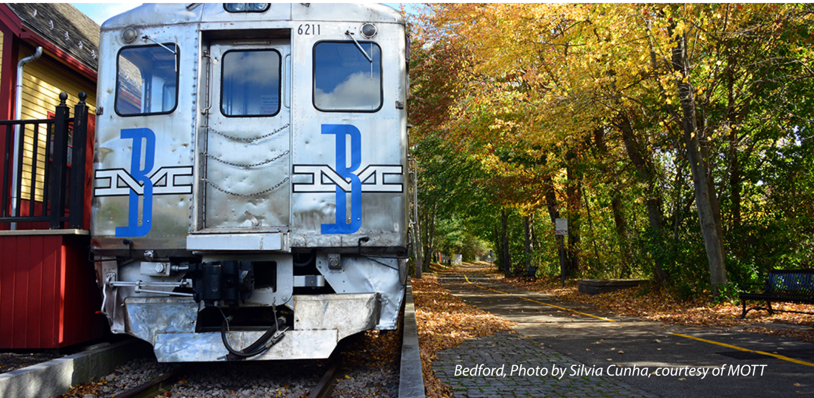
Bedford, Photo by Silvia Cunha, courtesy of MOTT

Read more studies on the Boston Region MPO's Recent Publications webpage .