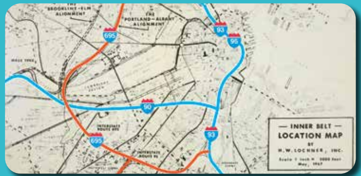
Projects, such as the Inner Belt in Massachusetts, would have displaced thousands of people.