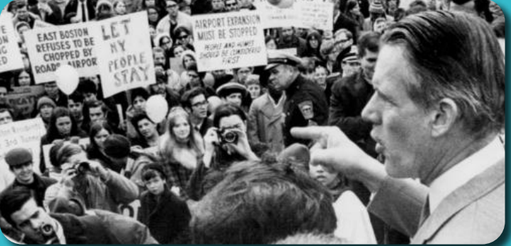
On November 30, 1970, not long after becoming Governor of Massachusetts, Francis Sargent declared a moratorium on highway building inside the Route 128 loop and called for a comprehensive multimodal study of the region's transportation needs.

In combination with the nation's environmental movement, and the passage of the federal Clean Air Act, establishment of other air quality regulations, and the creation of the EPA, these advocacy efforts attracted significant political support to the highway revolts.