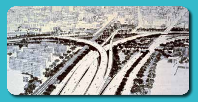
MPOs were in a large part a reaction to the 1950s era of highway building.