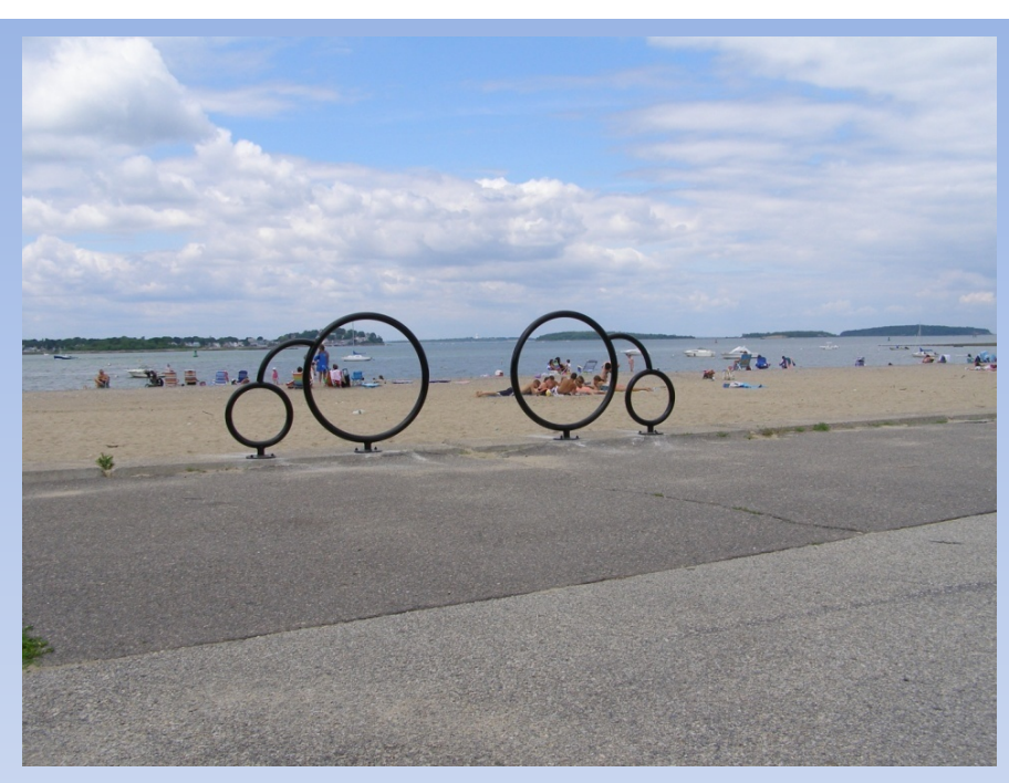
Regional Bicycle Parking Program