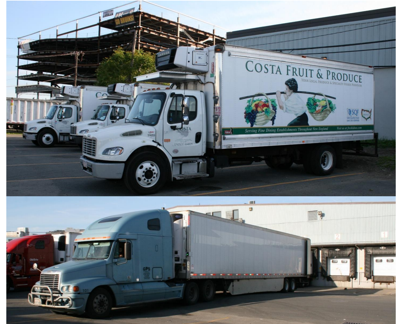
Figure 5 Refrigerated Trucks: Single-Unit and Semi-Trailer