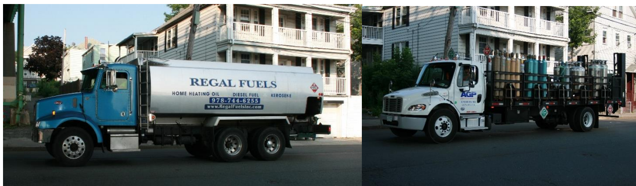
Figure 8 Single-Unit Trucks with Hazardous Cargoes