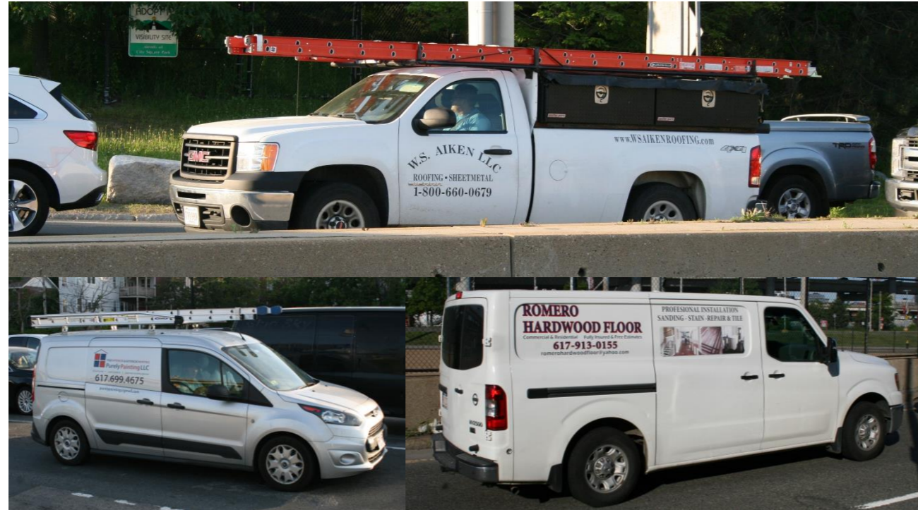
Figure 3 Light Commercial Vehicles