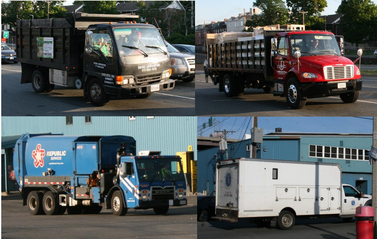
Figure 6 Other Single-Unit Trucks