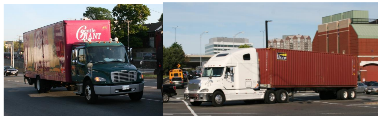
Figure 4 Box-Type Trucks: Single-Unit and Ocean Shipping Semi-Trailer