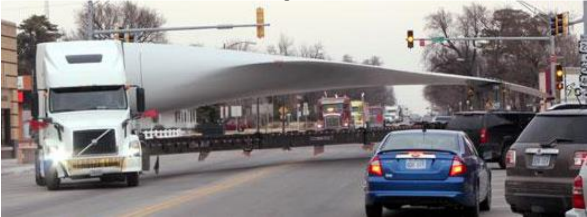
Figure 11 Oversized Loads: Delivering a Wind Turbine Blade

Turbine blades can be delivered to the testing center by water but most arrive by road. These are oversized loads and deliveries are made at night, approaching Boston on I-93 southbound, exiting at Sullivan Square, and traveling on the study corridor to City Square and then to the testing center via Chelsea Street. The turbines travel with a police escort that blocks traffic at intersections, and the turbine moves nonstop. The difficulty of moving cargo of this size can be seen in Figure 11, which shows a production turbine blade being delivered for installation at a location in Kansas.