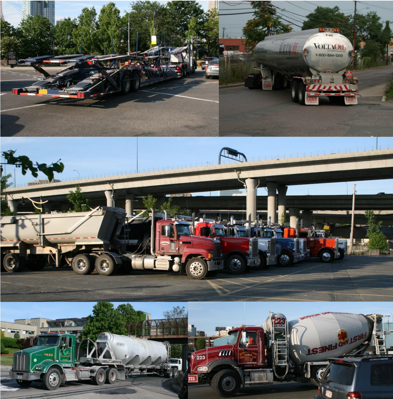
Figure 9 Truck Types that were Specifically Counted