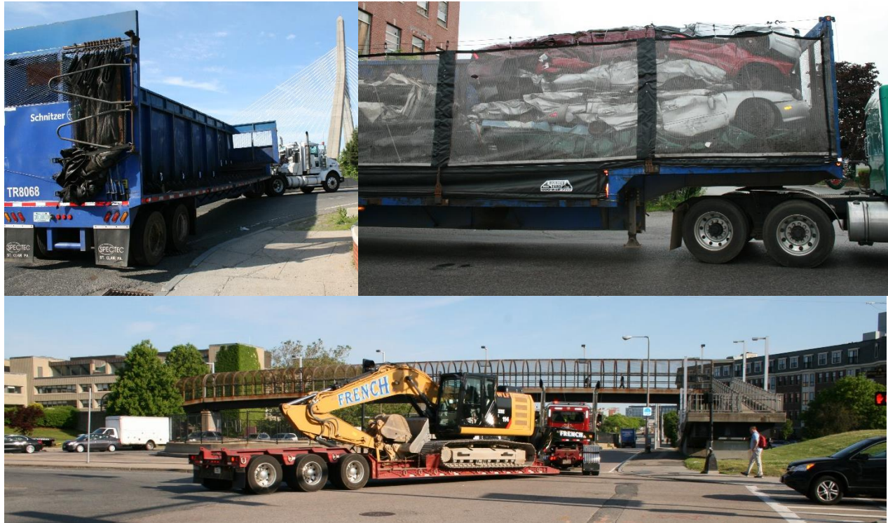
Figure 7 Other Semi-Trailer Trucks

Source: Central Transportation Planning Staff.